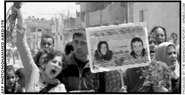
INTERNATIONALS HOLD UP PLACARDS WITH PICTURES OF HUMAN RIGHTS ACTIVISTS RACHEL CORRIE (L) AND THOMAS HURNDALL ON APRIL 22, 2003, SHORTLY AFTER CORRIE WAS CRUSHED TO DEATH AND HURNDALL SHOT IN THE HEAD BY ISRAELI SOLDIERS. ISRAEL NOW RESTRICTS FOREIGN JOURNALISTS, VOLUNTEERS AND NGOs FROM ENTERING THE OCCUPIED TERRITORIES TO REPORT WHAT IS HAPPENING TO THE OUTSIDE WORLD.

Americans, Israelis and other international human rights activists and journalists have put their lives on the line in the occupied territories, reporting and monitoring human rights abuses, acting as human shields, monitoring Israeli actions at border crossings, participating in peaceful demonstrations, helping farmers harvest their crops, and trying to prevent home demolitions.