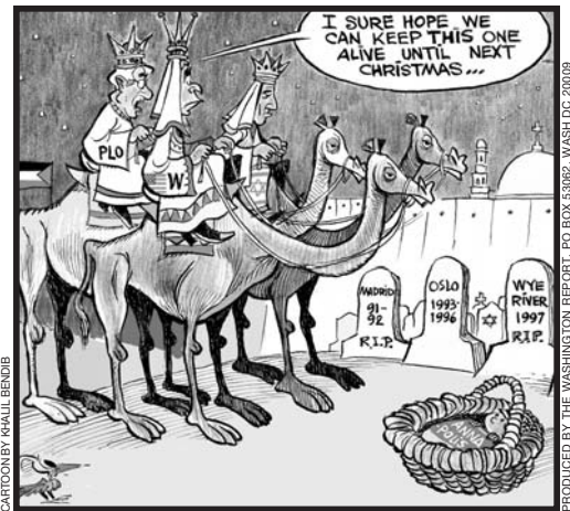
For a peace agreement to succeed by the end of 2008, each side must address core issues: borders, water, settlements, refugees, Jerusalem, and prisoners.

At the meeting, the leaders agreed to reach a settlement by the end of 2008. This isn't the first time a deadline for peace has been created. In order for a peace agreement to succeed this time, each side must genuinely address the core issues that have never been fairly tackled. These issues include Jewish settlements in the West Bank, Palestinian sovereignty over East Jerusalem, a just settlement of the claims of Palestinian refugees, the release of prisoners, water rights, and an end to Israel's blockade of the Gaza Strip—all of which, when justly settled, should bring about a final two-state solution that will allow both Palestinians and Israelis to live in peace and dignity.