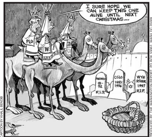
For a peace agreement to succeed by the end of 2008, each side must address core issues: borders, water, settlements, refugees, Jerusalem, and prisoners.

At the meeting, the leaders agreed to reach a settlement by the end of 2008. This isn't the first time a deadline for peace has been created. In order for a peace agreement to succeed this time, each side must genuinely address the core issues that have never been fairly tackled. These issues include Jewish settlements in the West Bank, Palestinian sovereignty over East Jerusalem, a just settlement of the claims of Palestinian refugees, the release of prisoners, water rights, and an end to Israel's blockade of the Gaza Strip—all of which, when justly settled, should bring about a final two-state solution that will allow both Palestinians and Israelis to live in peace and dignity.