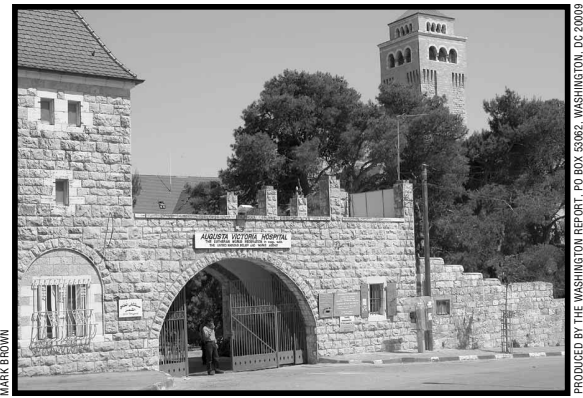
Augusta Victoria Hospital on Jerusalem's Mount of Olives is threatened with the loss of its historic tax-exempt status.

Other humanitarian organizations potentially affected by the hospital's court case include Catholic Relief Services, the Mennonite Central Committee, the International Christian Committee, and the Swedish Organization for Individual Relief.