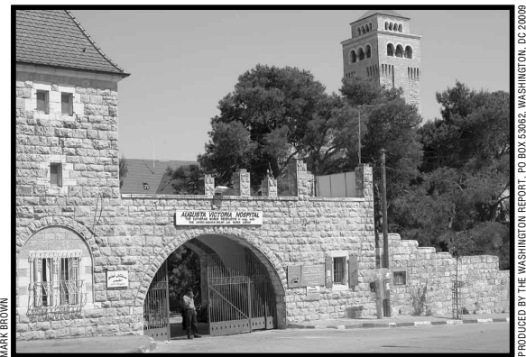
Augusta Victoria Hospital on Jerusalem's Mount of Olives is threatened with the loss of its historic tax-exempt status.

Other humanitarian organizations potentially affected by the hospital's court case include Catholic Relief Services, the Mennonite Central Committee, the International Christian Committee, and the Swedish Organization for Individual Relief.