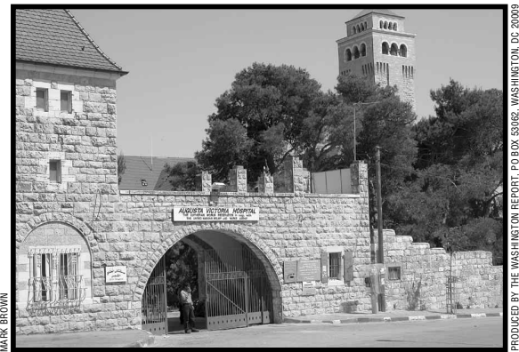
Augusta Victoria Hospital on Jerusalem's Mount of Olives is threatened with the loss of its historic tax-exempt status.

Other humanitarian organizations potentially affected by the hospital's court case include Catholic Relief Services, the Mennonite Central Committee, the International Christian Committee, and the Swedish Organization for Individual Relief.