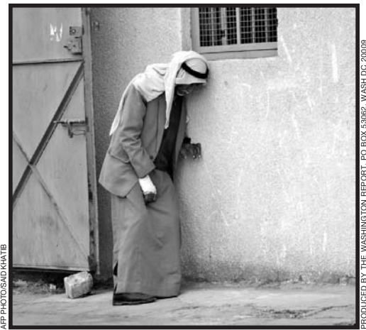
PRODUCED BY THE WASHINGTON REPORT, PO BOX 53062, WASH DC 20009 An elderly Palestinian refugee waits to receive a ration of food aid at an UNRWA warehouse in Rafah, Gaza Strip, Oct. 25, 2007.

In addition, only one border allowing humanitarian supplies into the Strip remains open. Israel, with the West's support, has declared Gaza an enemy entity. With each day of Israeli sanctions on the Gaza Strip, the already desperate situation of its people worsens. Poverty is increasing and unemployment is alarmingly high. Most Gazans now depend on food aid. Commercial activity has come to a halt. Many Gaza residents, the victims of a ruthless form of collective punishment, have lost hope.