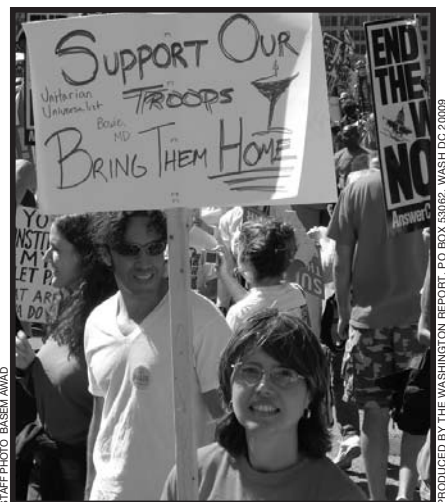
Thousands of Americans gathered in Washington, DC on Sept. 15 to call for an end to the war in Iraq.

President George W. Bush says he will bring 5,700 U.S. troops home from Iraq by Christmas, and more by July, bringing the number of troops fighting in Iraq to pre-surge levels of about 132,000. Polls show that most Americans disapprove of Bush's handling of the war, which has cost the lives of more than 3,700 U.S. troops, and about half a trillion dollars. Bush's plan is far removed from the desires of the American people, most of whom support a complete withdrawal starting now, and ending soon.