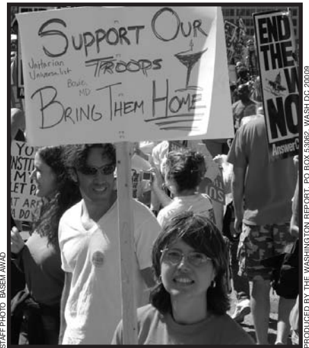
Thousands of Americans gathered in Washington, DC on Sept. 15 to call for an end to the war in Iraq.

President George W. Bush says he will bring 5,700 U.S. troops home from Iraq by Christmas, and more by July, bringing the number of troops fighting in Iraq to pre-surge levels of about 132,000. Polls show that most Americans disapprove of Bush's handling of the war, which has cost the lives of more than 3,700 U.S. troops, and about half a trillion dollars. Bush's plan is far removed from the desires of the American people, most of whom support a complete withdrawal starting now, and ending soon.