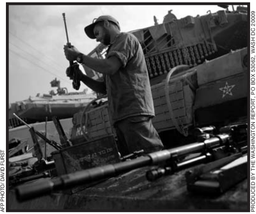
An Israeli soldier cleans his weapon following a July 6, 2007 commando-style raid into Gaza's Mughazi refugee camp which killed 11 Palestinians.

The United States is financially rewarding Israel with a $30 billion arms care package at a time when Tel Aviv is flouting international law and ignoring Arab peace overtures.