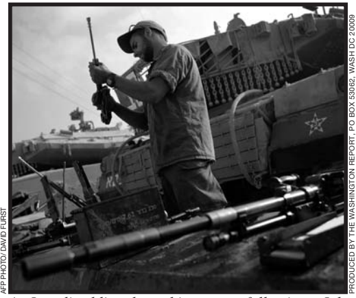
An Israeli soldier cleans his weapon following a July 6, 2007 commando-style raid into Gaza's Mughazi refugee camp which killed 11 Palestinians.

The United States is financially rewarding Israel with a $30 billion arms care package at a time when Tel Aviv is flouting international law and ignoring Arab peace overtures.